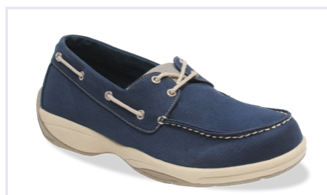
11400 Canvas Boat Shoe Navy Lace