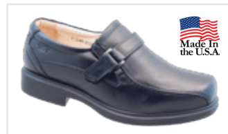
D2010 | Entice Black, Brown