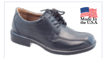
D2013 | Appeal Black