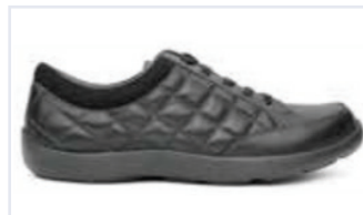
No. 75 Casual Sport Black