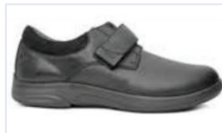
No. 66 Casual Comfort Stretch Black Stretch