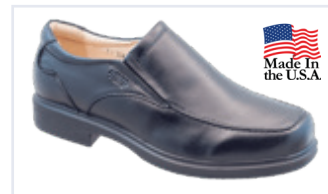
D2011 | Allure Black