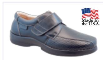
D2009 | Reveler Black