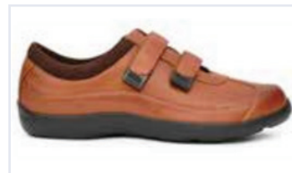
No. 97 Casual Sport Saddle