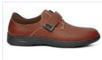
No. 64 Casual Comfort Whiskey