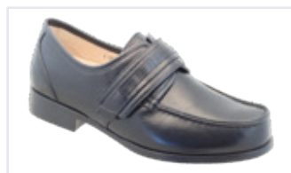
D2021 | Fashionista Black