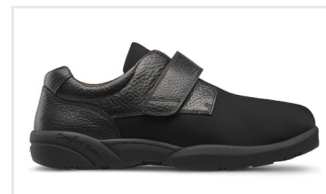
6910 | Brian X Black Lycra Double Depth Shoe