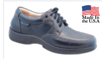
D2004 | Voyager Black, Brown