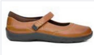
No. 19 Casual Mary Jane Cognac