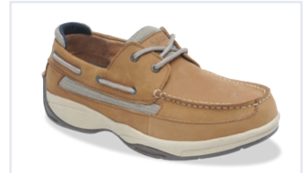
Boat Shoe 10200-TL Tan Lace