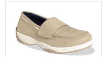
10410 Canvas Boat shoe Khaki Velcro