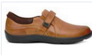
No. 51 Casual Dress Cognac