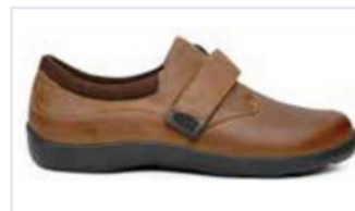
No. 67 Casual Comfort Chocolate