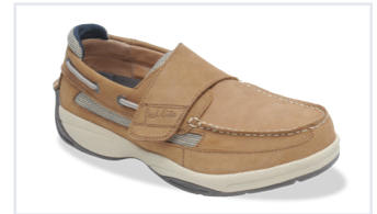
Boat Shoe 10200-TV Tan Velcro