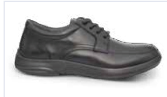
No. 12 Casual Oxford Black