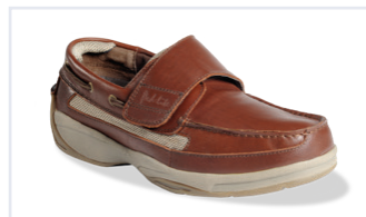
Boat Shoe 10200-DBV Brown Velcro