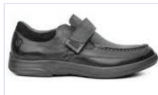
No. 52 Casual Dress Black