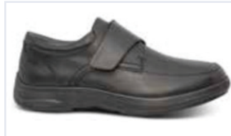
No. 28 Casual Oxford Black