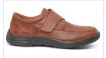
No. 28 Casual Oxford Burnished Brown