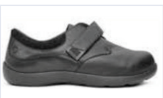
No. 81 Casual Double Depth Black Stretch