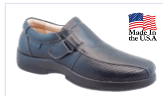
D2015 | Adventurer Black