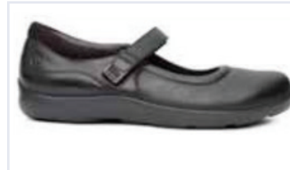
No. 33 Casual Mary Jane Stretch Black Stretch