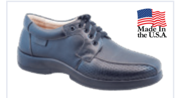
D2006 | Pioneer Black