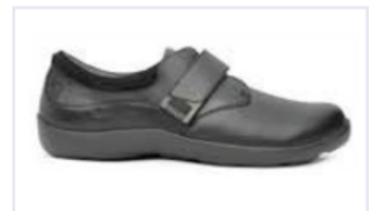
No. 67 Casual Comfort Black