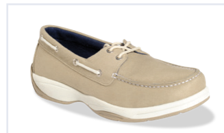
10400 Canvas Boat Shoe Khaki Lace

A classy male canvas boat shoe, offers a unique casual style any leisure time activity. Built on the same outsole and last as the Oliver, the Michael shoe provides same incredible depth and comfort.