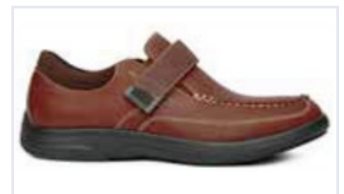
No. 52 Casual Dress Whiskey