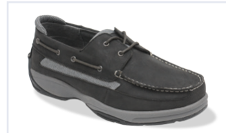
Boat Shoe 11200 Black Lace