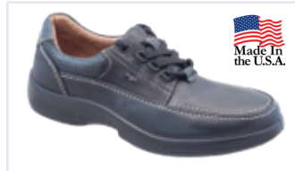
D2001 | Explorer Black, Brown