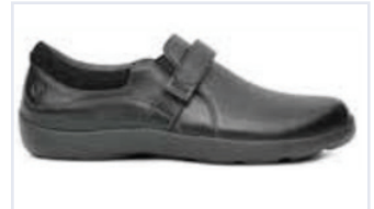
No. 51 Casual Dress Black