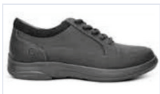
No. 72 Casual Sport Oil Black