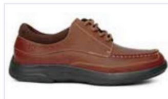
No. 30 Casual Dress Whiskey