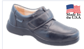
D2002 | Walker Black, Brown