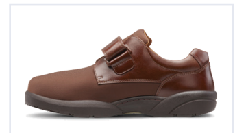
6920 | Brian X Acorn Lycra Double Depth Shoe