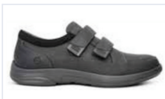
No. 96 Casual Sport Oil Black