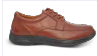
No. 12 Casual Oxford Burnished Brown