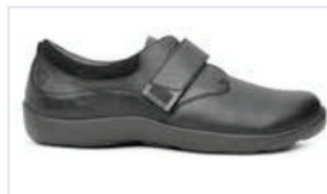
No. 63 Casual Comfort Stretch Black Stretch