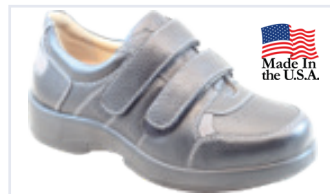
D2018 | Globetrotter Black