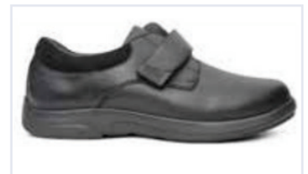
No. 88 Casual Double Depth Black Stretch