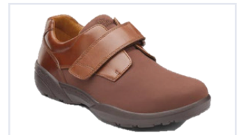
6520 | Brian Acorn Lycra Shoe