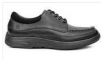
No. 30 Casual Dress Black