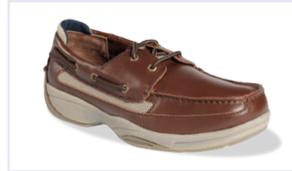
Boat Shoe 10200-DBL Brown Lace

The all leather boat shoe provides a classic look with casual comfort and style. Oliver has 3/8" of extra depth and hides 1/4" in the sole, giving it the appearance of a "true" boat shoe rather than a bulky diabetic shoe look.