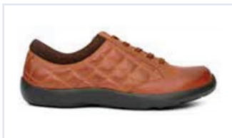
No. 75 Casual Sport Saddle