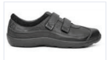
No. 97 Casual Sport Black