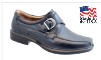
D2020 | Wrangler Black