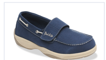
11410 Canvas Boat Shoe Navy Velcro