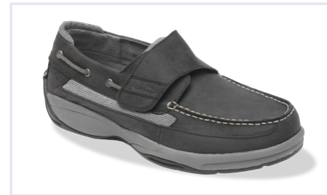
Boat Shoe 11210 Black Velcro