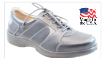
D2017 | Pathfinder Black