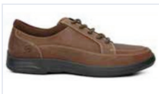
No. 72 Casual Sport Oil Brown