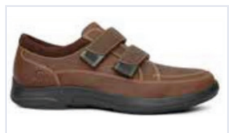
No. 96 Casual Sport Oil Brown