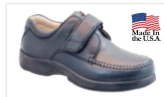
D2016 | Seeker Black