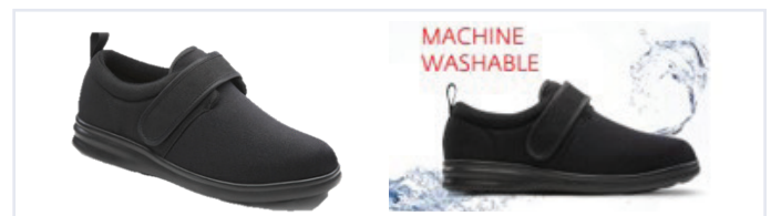
9110 | Carter (Double Depth) Machine Washable Lycra Shoe

Looking for added comfort and accommodation? Try our men's Carter shoe which features a machine washable Lycra® upper with two-way contact closure for extra flexibility. The double depth design built 1/4 inch deeper accommodates foot deformities such as bunions or hammertoes