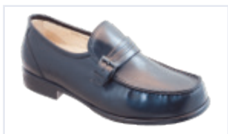
D2019 | Stylist Black