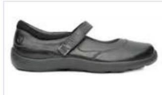
No. 19 Casual Mary Jane Black