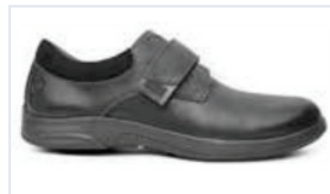
No. 64 Casual Comfort Black