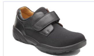
6410 | Brian Black Lycra Shoe

The lycra shoes feature a breathable and stretchable Lycra® upper with leather trim and a contact closure. Ideal for feet with bunions and hammertoes.